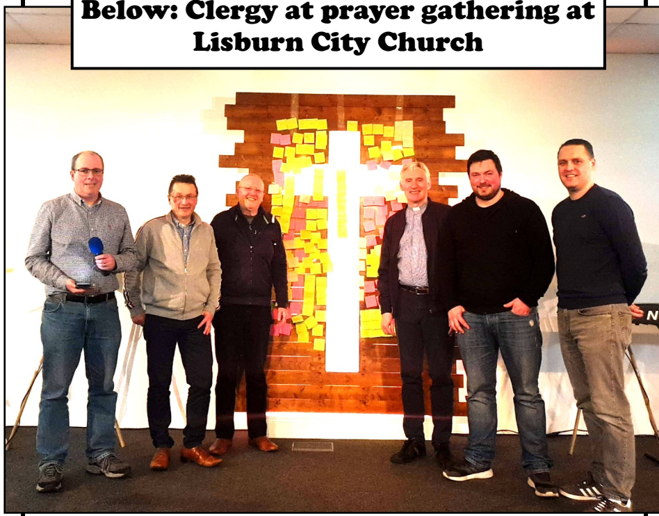
Below: Clergy at prayer gathering at Lisburn City Church