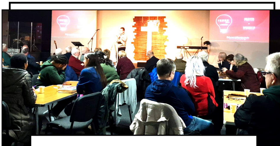
Above: Prayer gathering at Lisburn City Church